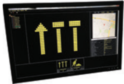
VMS Director Software

Available as an additional feature on the VMS