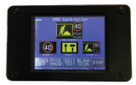
TM405C & TM506C Controller